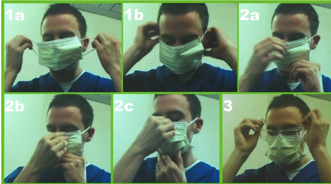
Steps for putting on a mask